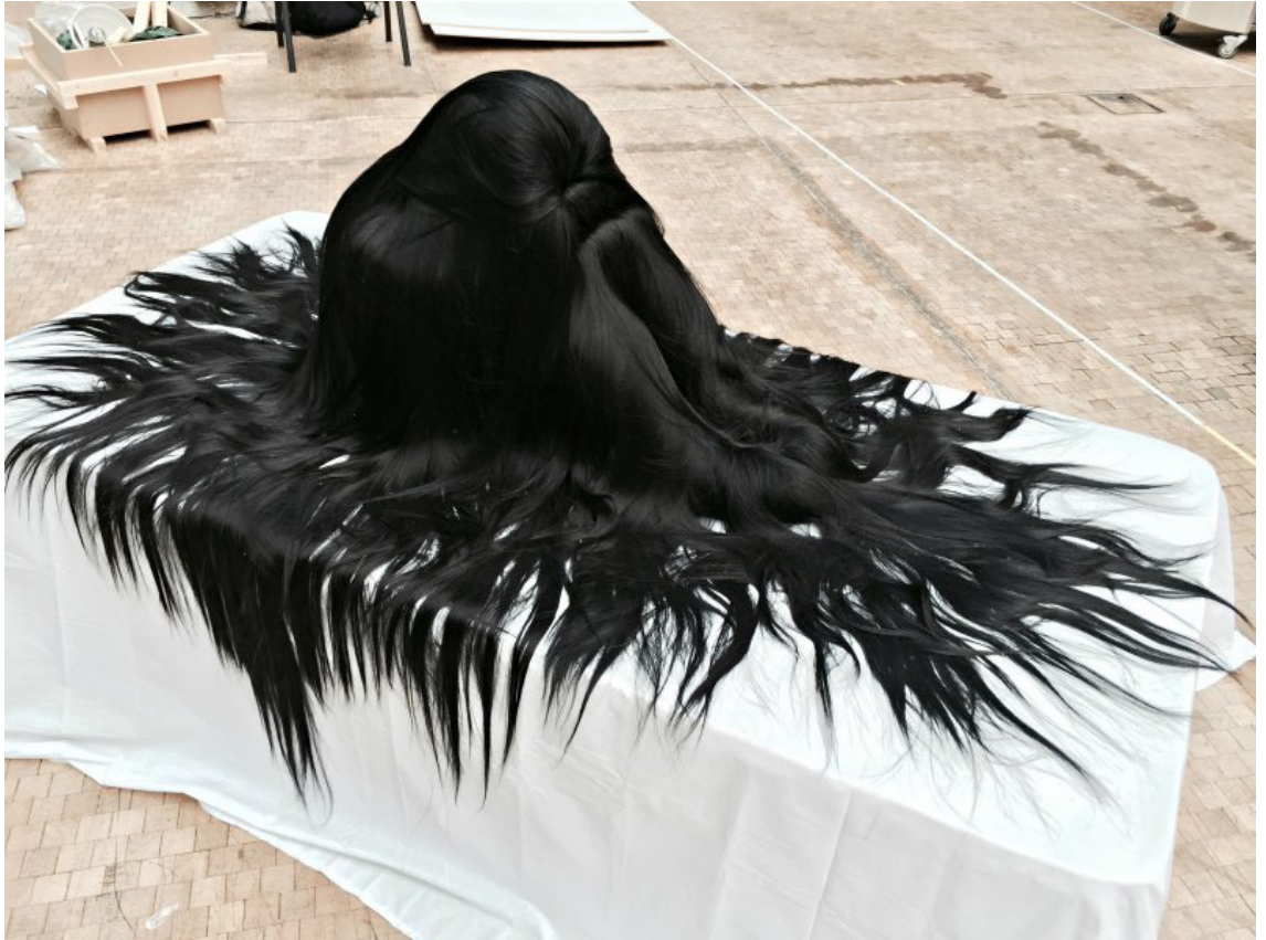
Liminality - Found Objects, Household, Interactive, Other, 2016 200(W) x 120(H)