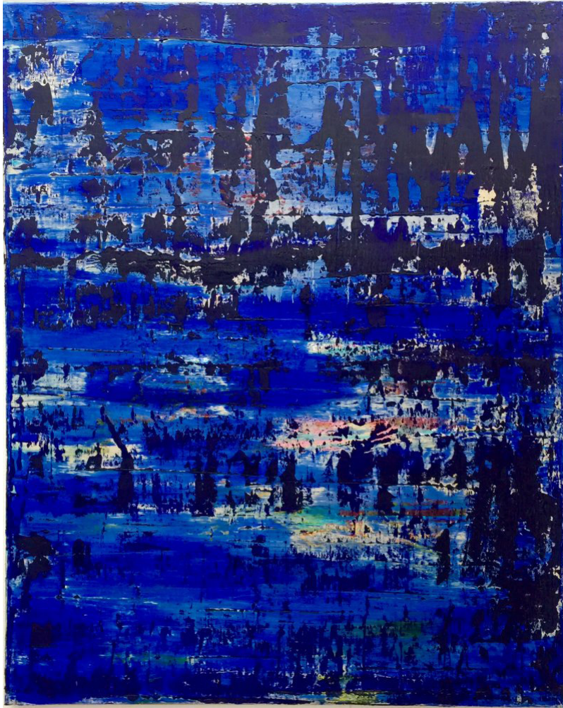
N#2 - Canvas, Oil, unframed, 2016 80(W) x 100(H)