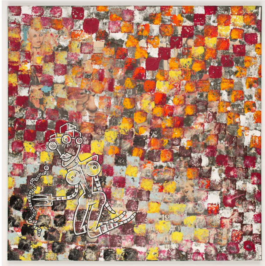
Crack of Ages - Acrylic, unframed, 2006 60(W) x 60(H)